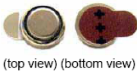
(top view) (bottom view)