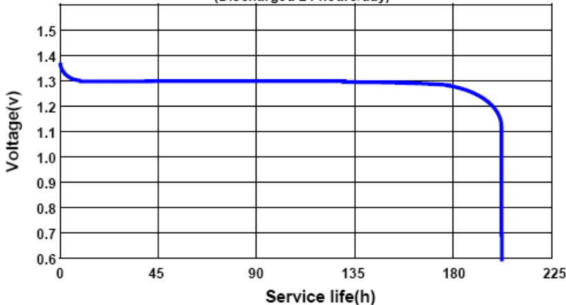
DISCHARGE CHARACTERISTICS AT 1500Ω 25°C 60%RH (Discharged 24 hours/day)