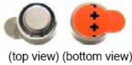
(top view) (bottom view)